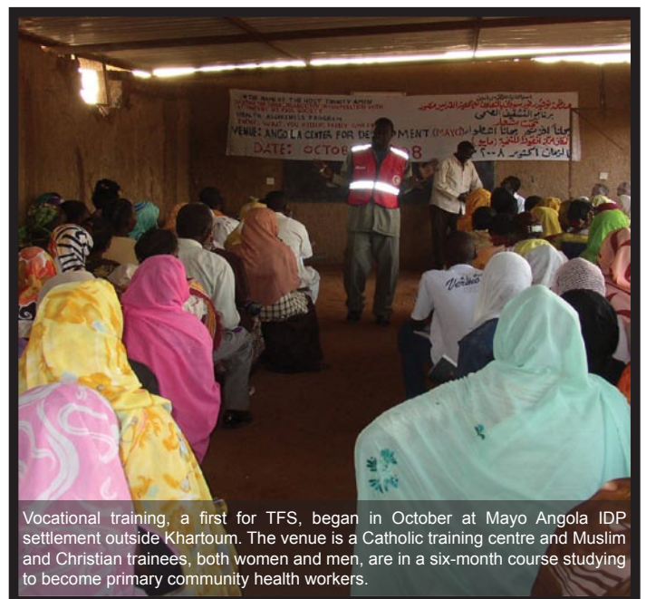
Vocational training, a first for TFS, began in October at Mayo Angola IDP settlement outside Khartoum. The venue is a Catholic training centre and Muslim and Christian trainees, both women and men, are in a six-month course studying to become primary community health workers.