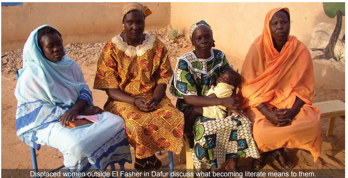
Displaced women outside El Fasher in Dafur discuss what becoming literate means to them.

In other developments, the Together for Sudan HIV/AIDS Awareness Outreach teams have been upgraded by UNAIDS and will concentrate on school children in this coming years. We are grateful to CAFOD for funding this project and also to ICING in Saudi Arabia whose funding will enable us to develop our Elementary Scholars Project for HIV/AIDS affected children. Sadly, both the Eye Care Outreach and the Teacher Training and Support Project are on hold as we await funding. That two of our most valuable and popular projects have gone dark even temporarily is a blow to hundreds of people. Can you help rekindle their hopes?